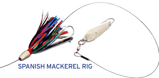
SPANISH MACKEREL RIG