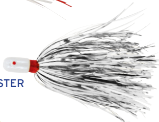
BUG EYE DUSTER