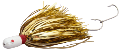
BUG EYE DUSTER KING RIG