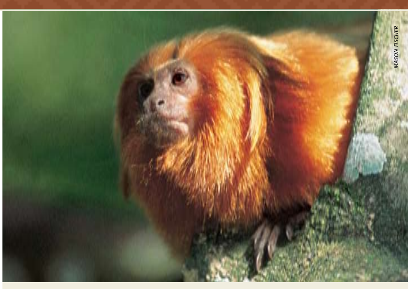
Above: Look for the endangered golden lion tamarin in the Poço das Antas Biological Reserve.

MONDAY, OCTOBER 10 - RIO DE JANEIRO / POÇO DAS ANTAS BIOLOGICAL RESERVE - After an early breakfast we begin our drive from Rio de Janeiro to the lowland rainforests of the Poço das Antas Biological Reserve, a stronghold for the endangered golden lion tamarin. This morning we have the unique opportunity to work with primatologists as they track the tamarins and observe