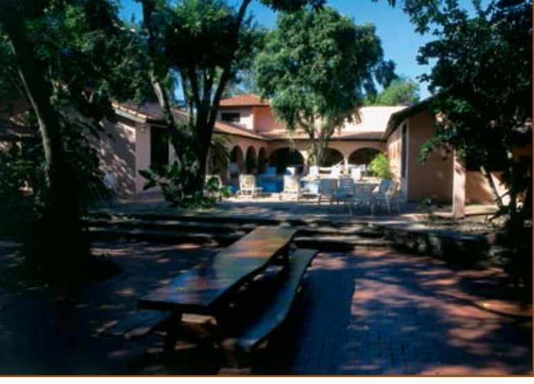
Above and below: Refúgio Ecológico Caiman, our deluxe accommodations in the Patntanal.

Travel Protection Program: We highly recommend that you avail yourself of our travel protection program, since your personal insurance policies may contain limitations. Note that premiums are non-refundable.