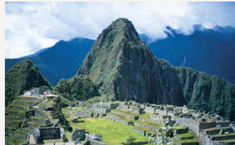
The peak of Huayna Picchu overlooks the great Inca city of Machu Picchu.

MONDAY, APR 10/NOV 13 — URUBAMBA / MACHU PICCHU - After