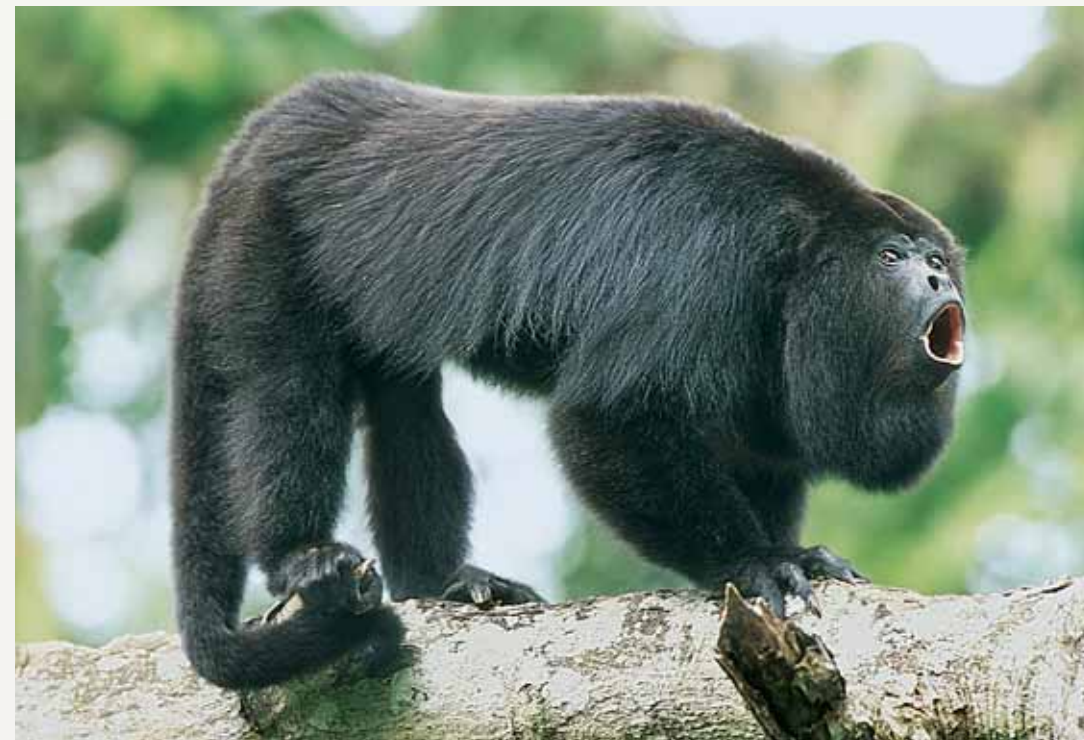
Roars of the black howler monkey reverberate through the forests.

PRINTED ON RECYCLED PAPER USING SOY-BASED INKS.