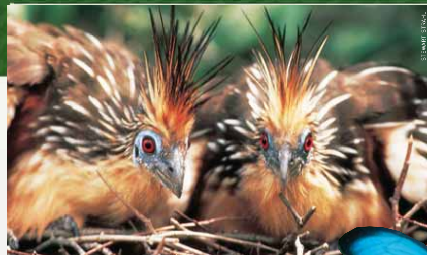
Above: Look for hoatzins on your daily excursions.

P.S. If you are unable to join us on this adventure, please pass this brochure along to someone who might be interested. Thank you!