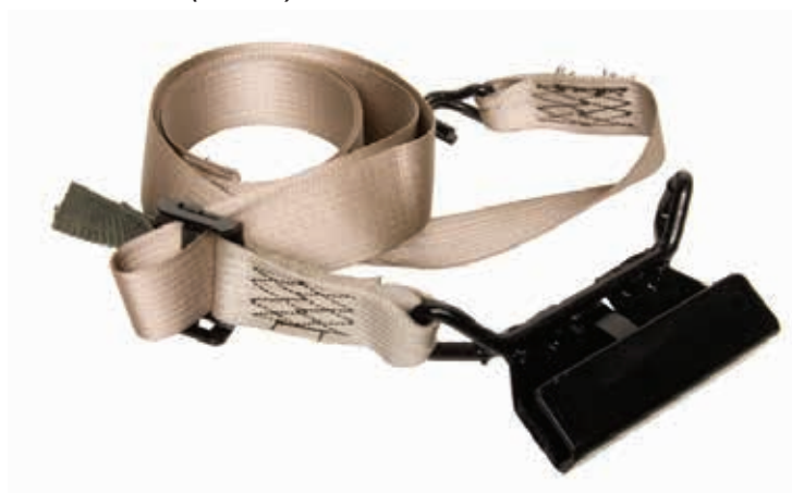
SINGLE TALON BRACKET (PN 85159)

A copy of these instructions and revised 2009 Raptor instructions will also be available on our website.