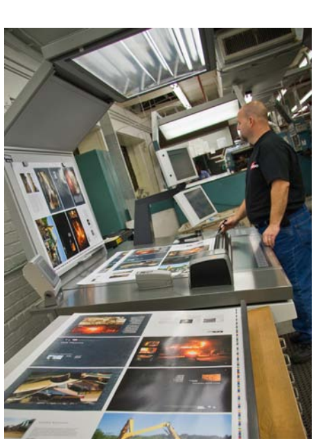
All operations of the press are controlled by the operator at the main terminal.

Seats Filling Fast for Upcoming FREE Adobe Seminar