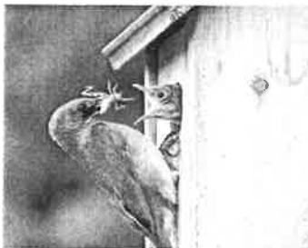
Bluebird and House

A garden filled with native trees, shrubs and perennials can go a long way toward assisting nesting birds because, according to the type of bird, they may use safe ground sites among the leaf litter for nesting, or cavities in trees or water areas like wild ponds. Many species have specialized nesting needs, and you could consider providing for those by adding specific types of nesting boxes for birds like bluebirds or chickadees.