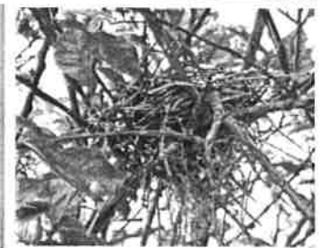
Top Row: Carolina Chickadee and Nest in Tree Bottom Row: Mockingbird and Nest