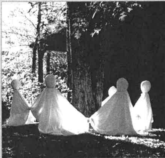
Mt Laurel's Fall Festival, decorated houses and yards, and even stormy weather on Halloween night made the town a special place in October.