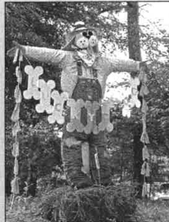
Congratulations to the winners of Mt Laurel's annual Scarecrow Contest! Pictured left to right: Hilltop Montessori School, first place; the Mt Laurel Garden Group, second place; and Lucky Dog Grooming and Boutique, third place.