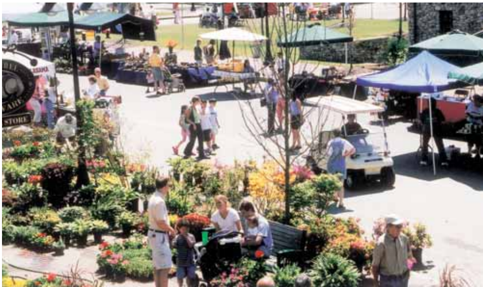
(Top) Deciding what to buy at the Farmers' Market and Craft Fair can be a daunting task! (Above) Meet friends during the Mt Laurel Farmers' Market and Craft Fair during the spring and summer.

Nothing relays a sense of community quite like meeting neighbors at the Farmers' Market and Craft Fair on a warm Saturday morning. And why not? When it's just down the street, there's no excuse not to find a small treasure. From organic fruits and vegetables to baked goods, crafts and one-of-a-kind works of art, you're sure to find something for the entire family. Take your kids for a cup of fresh-squeezed lemonade, then peruse the jars of fresh-from-the-hive honey. The Town of Mt Laurel comes alive year-round with exciting, family-centered special events.