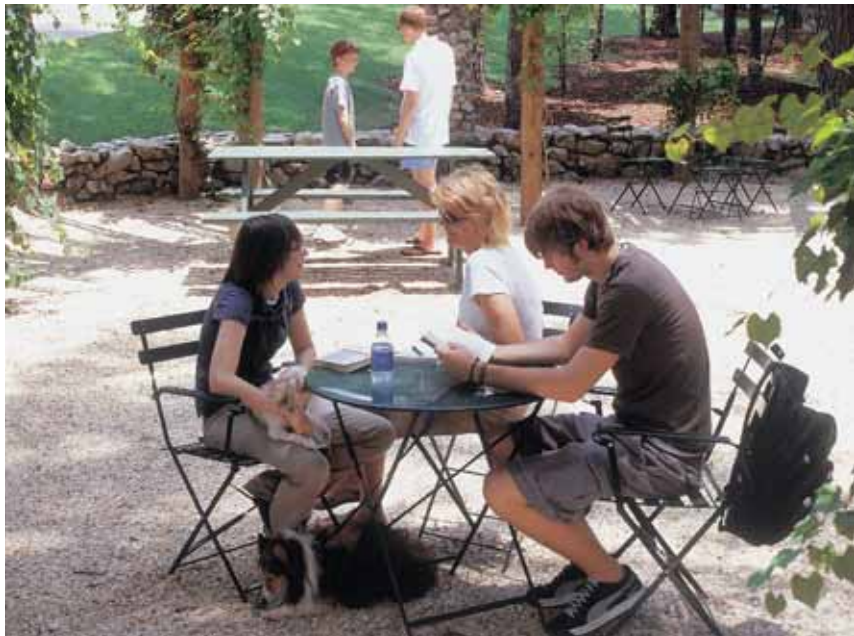
(Top) There's something for everyone at Mt Laurel Farmers' Market. (Above left) Turn off that T.V. and enjoy the day at Mt Laurel. (Above right) The great outdoors are never far away with Mt Laurel's three parks.