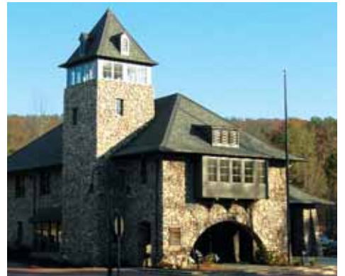
The Town Center features a Cahaba Valley Fire and Rescue Station. (Below) The Standard Bistro offers delectable French-American cuisine.