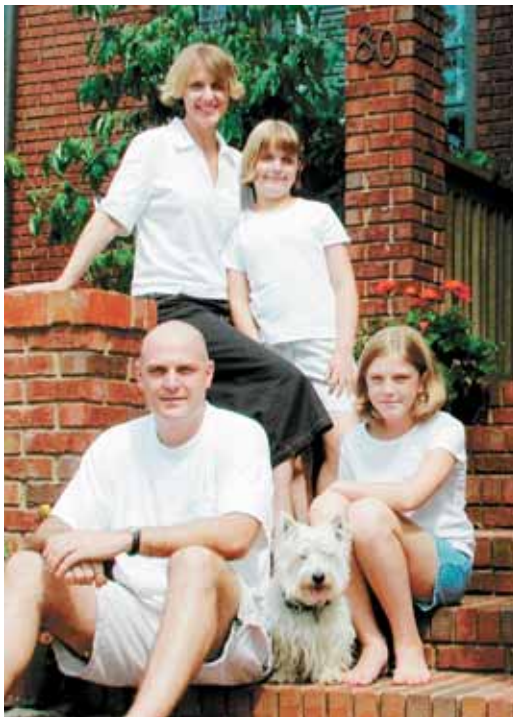
Mt Laurel is a place for families, big and small.