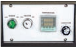
Tunnel Control Panel