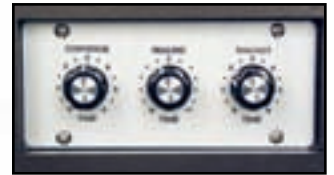
Sealer Control Panel