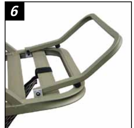
FOOTREST BUMPERS (PN 10668)