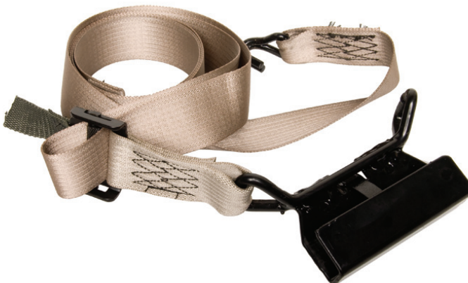
SINGLE TALON BRACKET (PN 85159)

A copy of these instructions and revised 2009 Raptor instructions will also be available on our website.