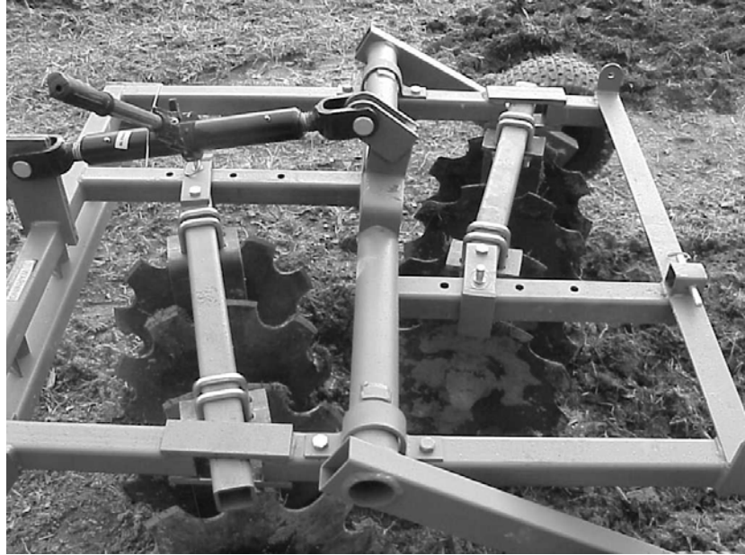
Figure 4: Here the Plot Mule is shown with the disc at 10°. This setting is mostly used for leveling, light discing or for covering seed. When covering seed, be sure to follow the recommended depth for the specific seed being planted. Raise or lower the transport wheels to control depth.

Figure 3: Here the Plot Mule is shown with the disc at 15°. This is the MFG recommended setting for most soil types. It is aggressive enough for most conditions and reduces the load on the ATV.