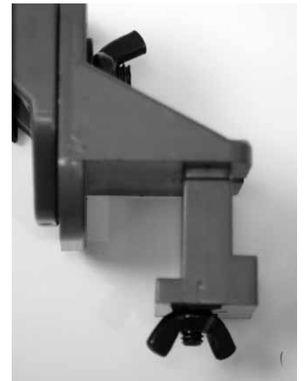
Figure 3. Figure 4.