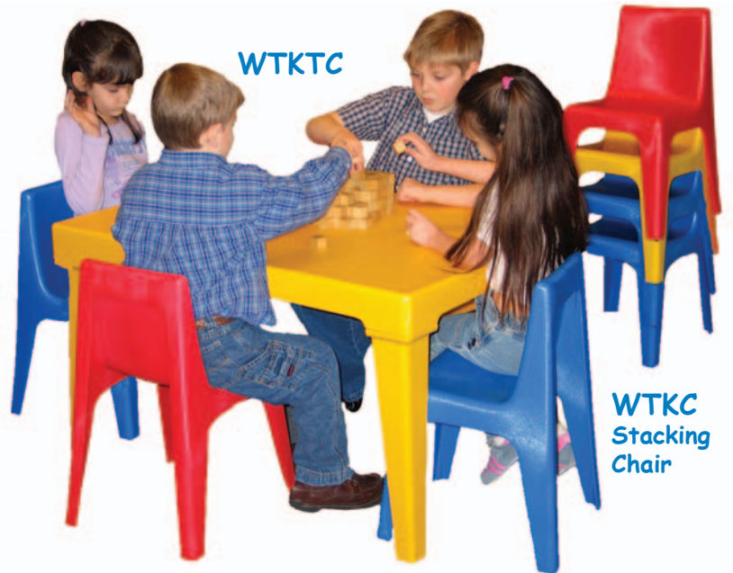
Table Color Choices