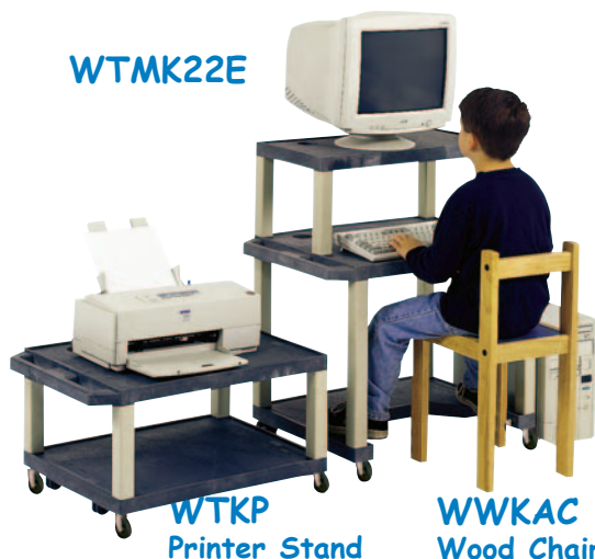
WTKP Printer Stand