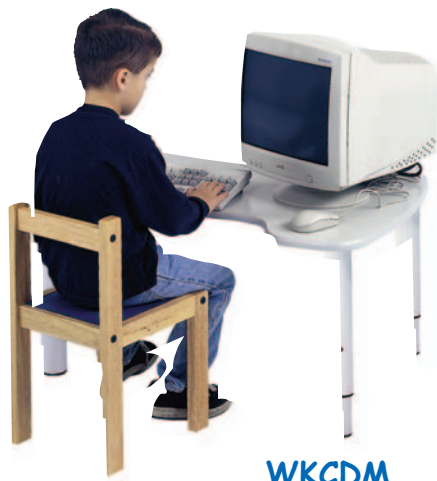
WWKAC Wood Chair