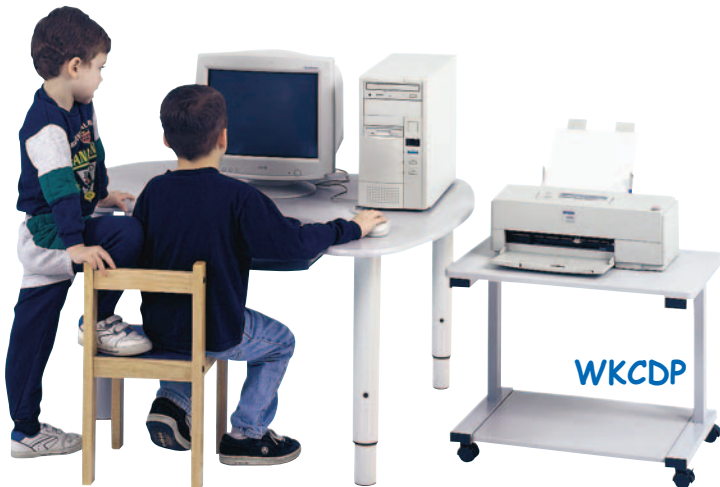
WWKAC Wood Chair