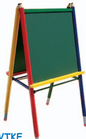
WTKBE Chalkboard on one side, dry erase marker board on other side.