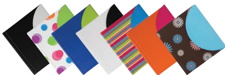
black w/ white polka dot royal w/ lime white w/ black striped orange w/ raspberry daisy

SAVE UP TO 27% Special Price $2.90 (C) 100 piece minimum