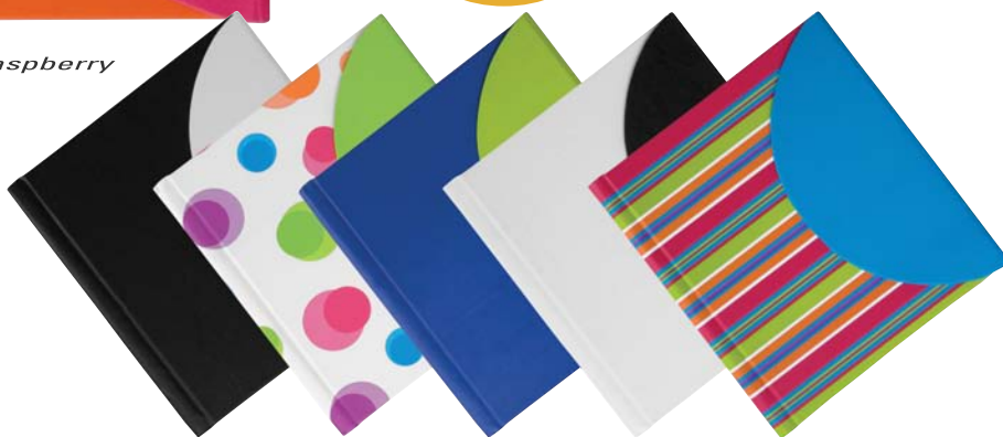
black w/ white

*100 minimum (C), 1 color / 1 location screen print