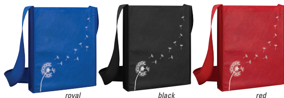
royal black red