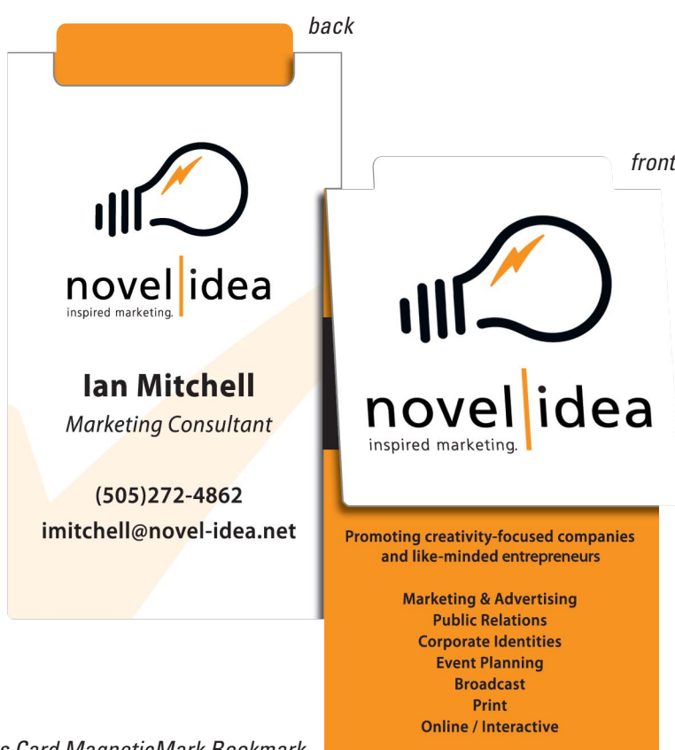
VT7904 Business Card MagneticMark Bookmark

There are no set-up or art charges involved with MagneticMark Bookmarks when you submit your order and artwork on the templates provided. If you prefer Vitronic to set-up your art, simply note this on your order and include an art creation charge of $60 (X)/hour. Pricing valid through 12.31.11