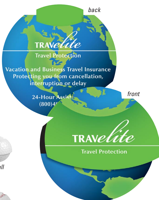
VT7905 Circle MagneticMark Bookmark