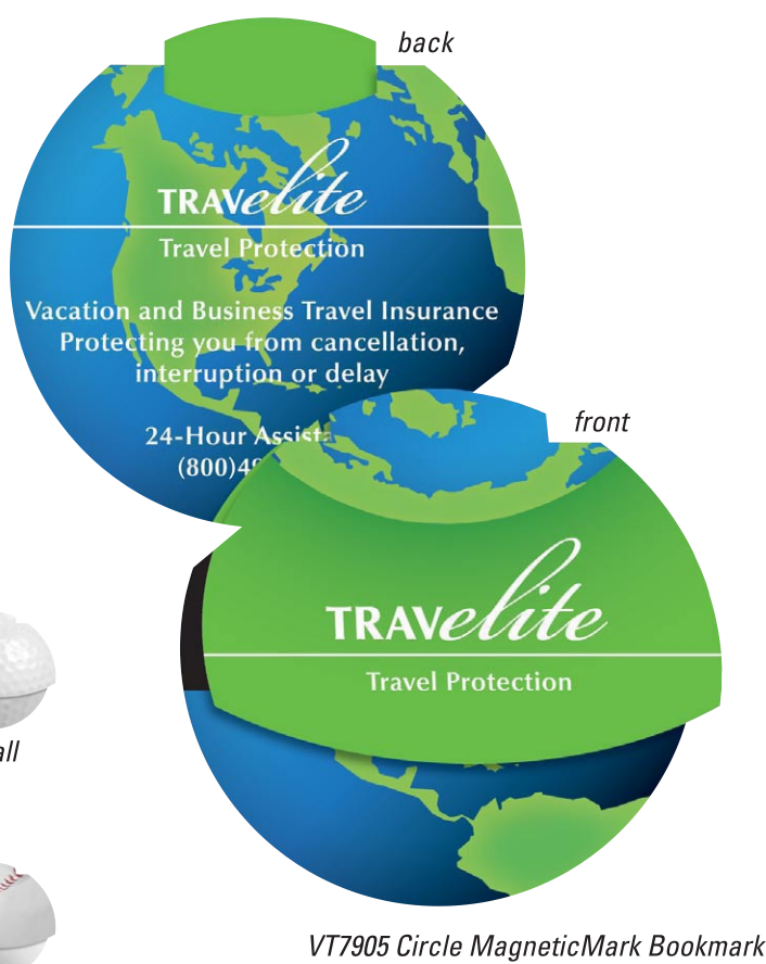
VT7905 Circle MagneticMark Bookmark