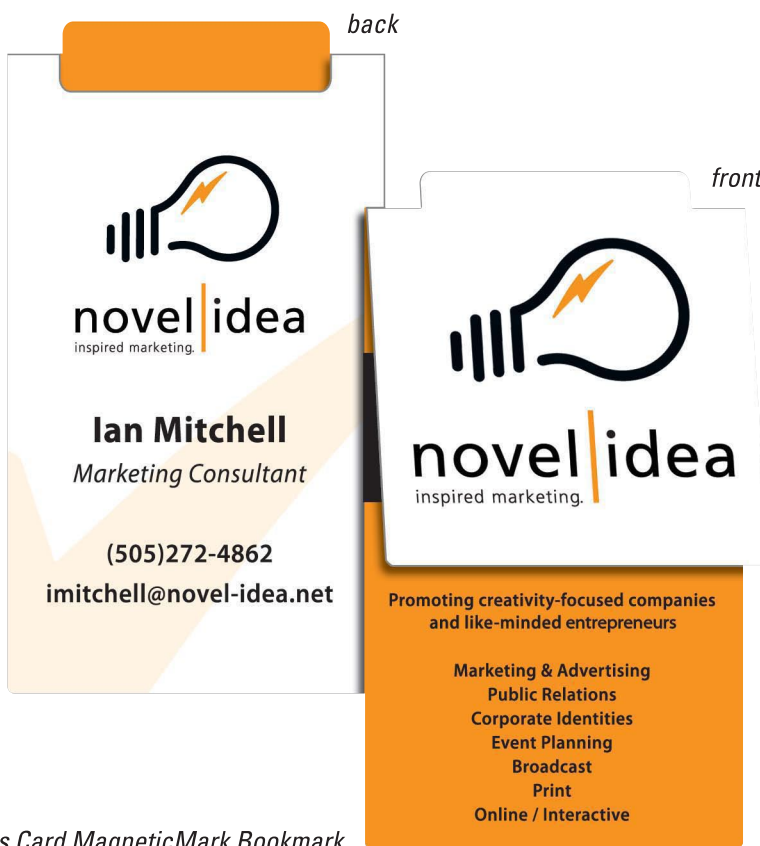
VT7904 Business Card MagneticMark Bookmark

There are no set-up or art charges involved with MagneticMark Bookmarks when you submit your order and artwork on the templates provided. If you prefer Vitronic to set-up your art, simply note this on your order and include an art creation charge of $60 (X)/hour. Pricing valid through 12.31.11