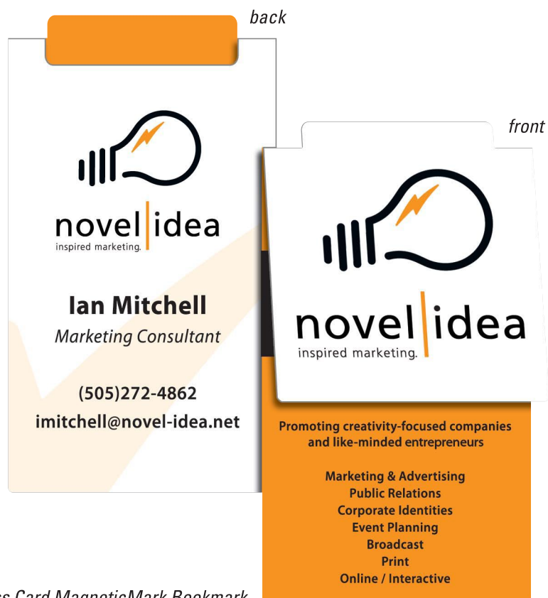
VT7904 Business Card MagneticMark Bookmark

There are no set-up or art charges involved with MagneticMark Bookmarks when you submit your order and artwork on the templates provided. If you prefer Vitronic to set-up your art, simply note this on your order and include an art creation charge of $60 (X)/hour. Pricing valid through 12.31.11