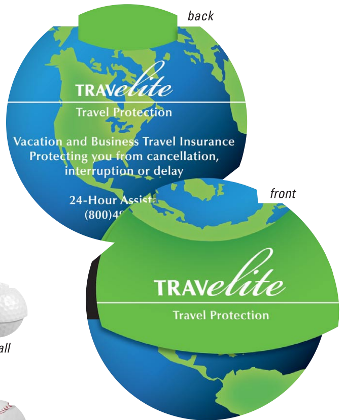
VT7905 Circle MagneticMark Bookmark