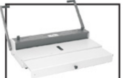
HC-8024 24" WIRE CLOSER