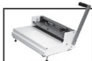
HD-8000 WIRE CLOSER