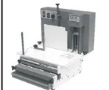
PAL-14 "Piks-A-Lift" mounted on the OD- 4012 ELECTRIC PUNCH