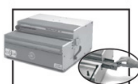
HD-7000 14" HEAVY DUTY OPEN END PUNCH