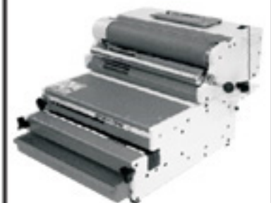
HD-4170 12" COIL INSERTER mounted on the OD-4012 11" ELECTRIC PUNCH