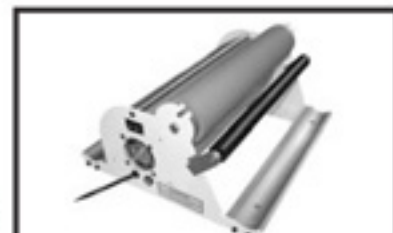
HD-e4100 Electric ECON-O-ROLL Coil Inserter