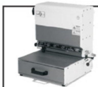
HD-7700H HORIZONTAL PUNCH