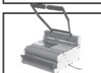
PC-248 MANUAL PUNCH AND ELECTRIC COILING SYSTEM