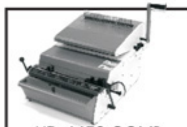
HD-4470 COMB OPENER MODULE with the HD-7700 HEAVY DUTY 14" PUNCH