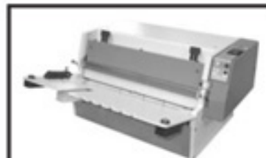
EWC-14 14" All Pitch (Shown) And EWC-24 24" All Pitch Flat Bar Wire Closer