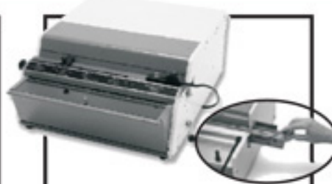
HD-7700 14" OPEN ENDED PUNCH