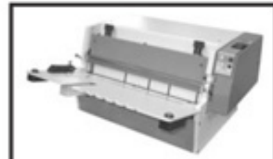
EWC-8370 Insert-A-Bind Wire Inserter/Closer