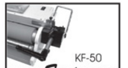
KF-50 KRIMP- Fast PLASTIC COIL CRIMPER