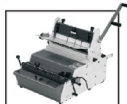
HD-8370 (3-1) shown with the HD-7700 14" HEAVY DUTY OPEN END PUNCH