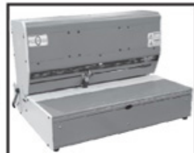
HD-7500H 24" HEAVY DUTY HORIZONTAL PUNCH