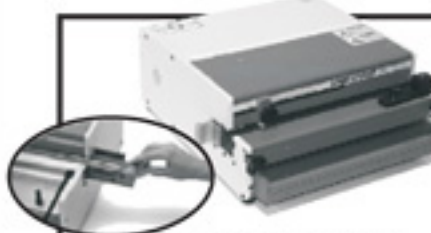
OD-4012 11" OPEN END ELECTRIC PUNCH