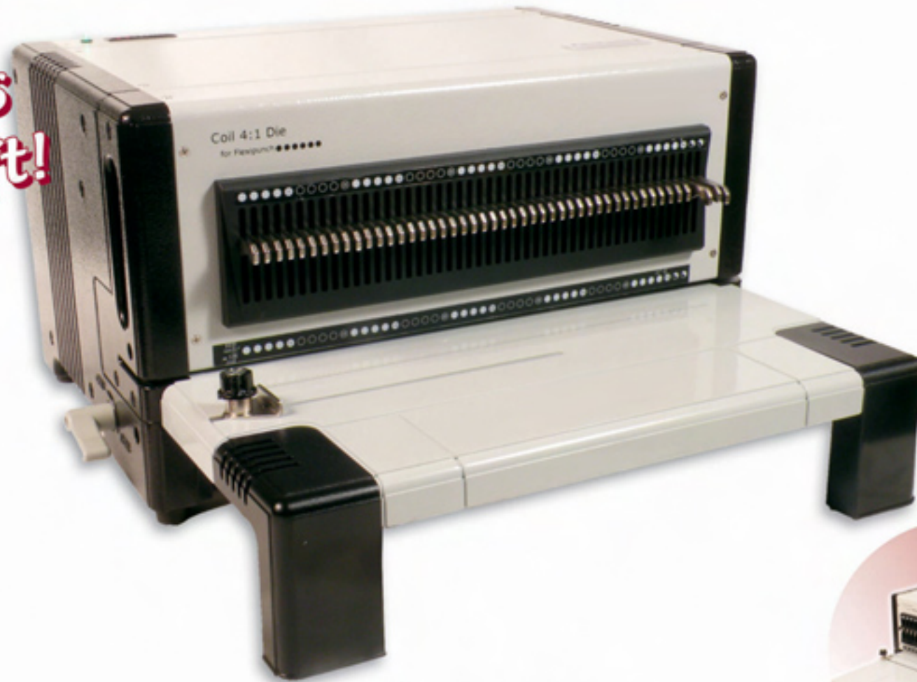
FlexiPunch-E (Electric Version)