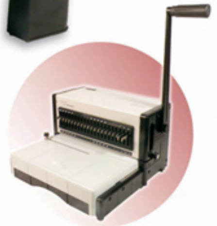
FlexiPunch-M (Manual Version)