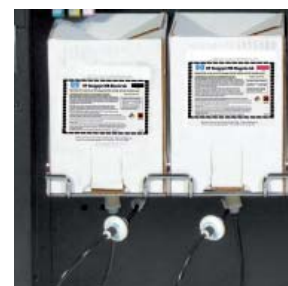
No-drip, quick connect/disconnect HP Designjet 788 inks