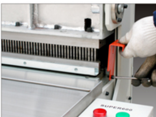
Put the screw in the red bracket then tight it connecting with the punching die