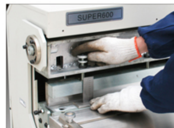
Insert and assemble closing die and adjust the height of closure according to the wire to be closed .