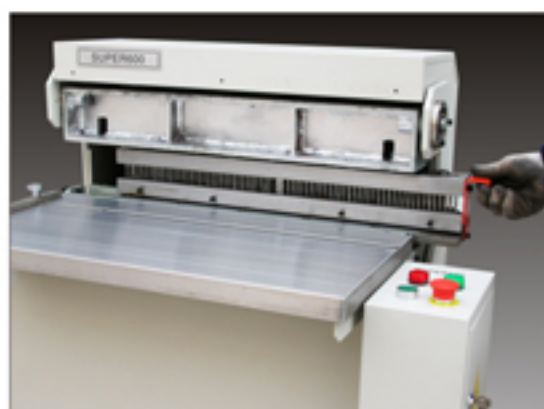
Take the punching die out by red bracket