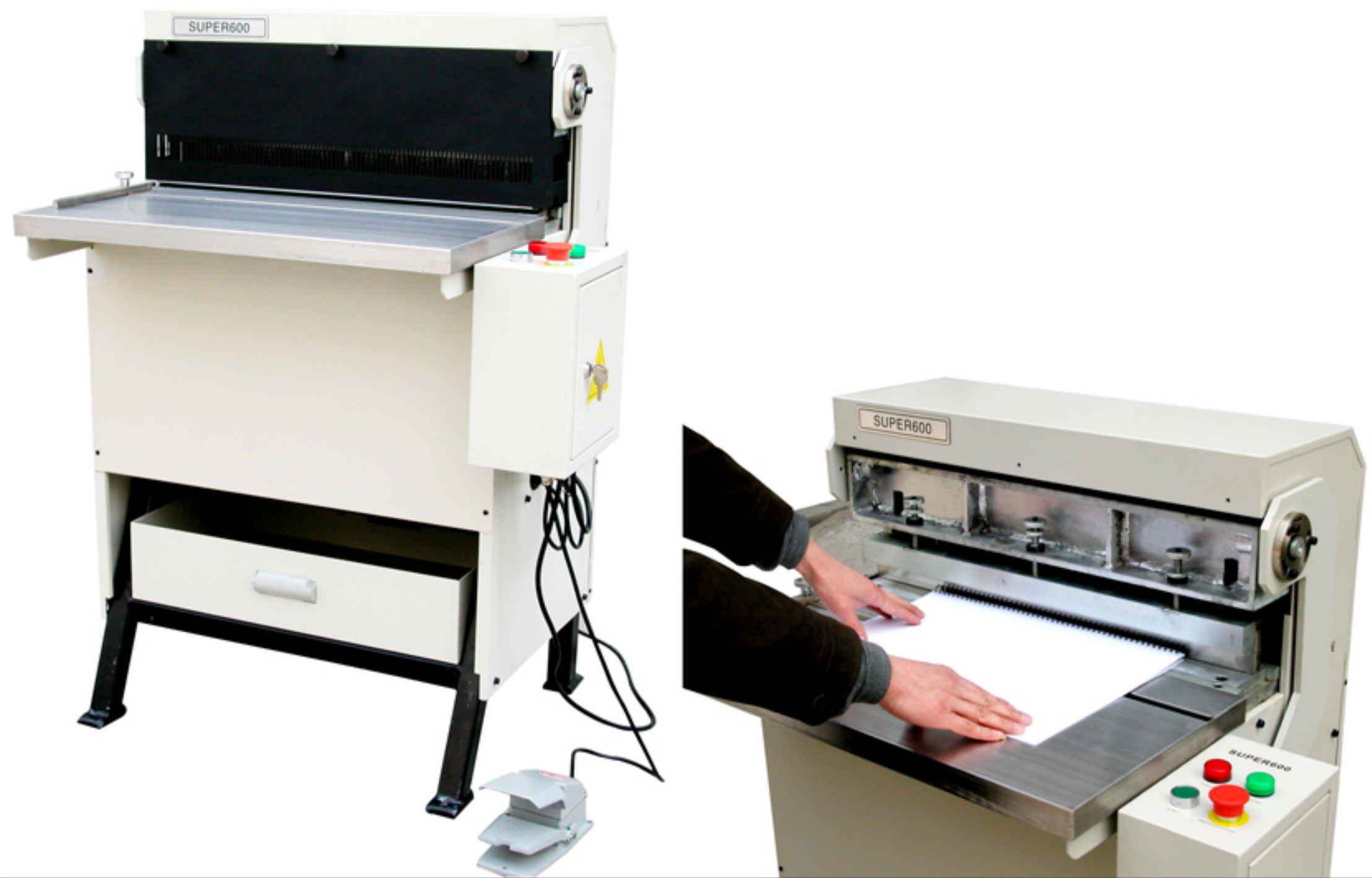
A magnetic device