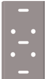
PART A Single Stud Plasma Mount Wall Bracket