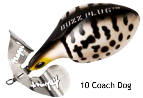
10 Coach Dog