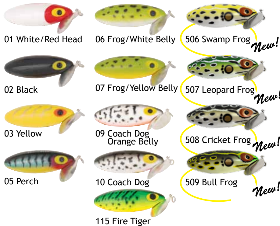
01 White/Red Head 06 Frog/White Belly 506 Swamp Frog New! 02 Black 07 Frog/Yellow Belly 507 Leopard Frog New! 03 Yellow 09 Coach Dog Orange Belly 508 Cricket Frog New! 05 Perch 10 Coach Dog 509 Bull Frog New! 115 Fire Tiger