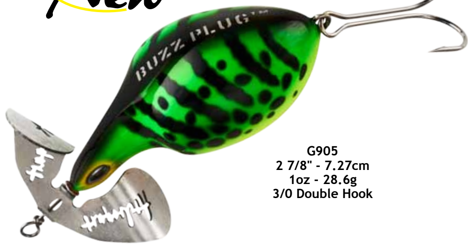
G905 2 7/8" - 7.27cm 1oz - 28.6g 3/0 Double Hook