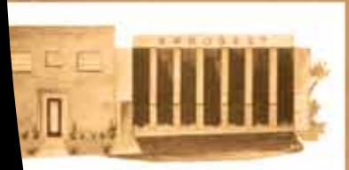
1965 building addition