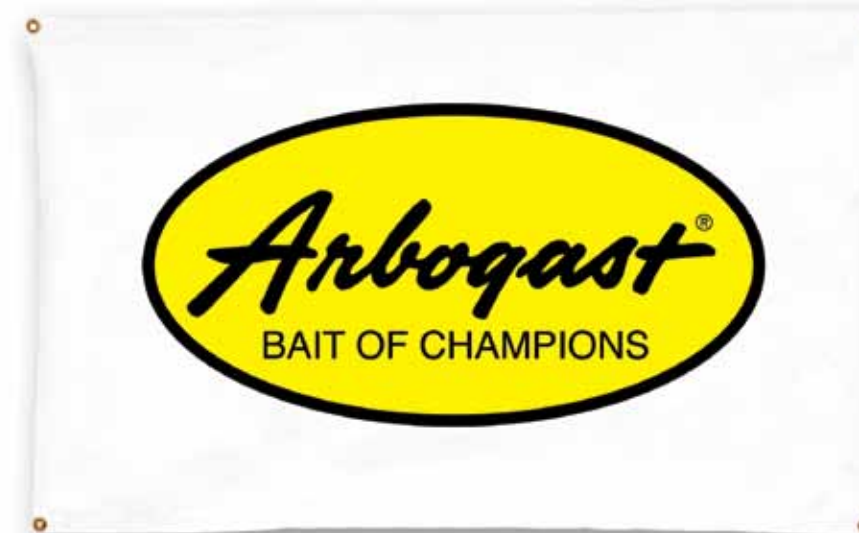
Arbogast Banner - UW10384

The Arbogast Bobber Stop™ is THE must-have accessory for every panfish angler. Once the angler locates the depth of the fish, they simply "mark" the spot on their line by installing the Bobber Stop™ spring. This will allow them to reel their line in completely, bait the hook then recast to that special fishing spot. Once the spring reaches the red bead, it will stop at the preset depth, keeping the bait at the correct depth every time. The angler can adjust the depth setting of the Bobber Stop™ with the flick of their finger. Easy-to-follow instructions for quick rigging are found on the back of the package.