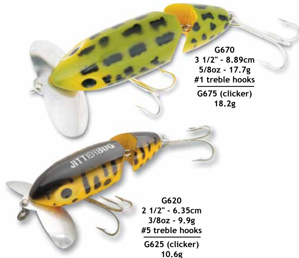
G670 3 1/2" - 8.89cm 5/8oz - 17.7g #1 treble hooks G675 (clicker) 18.2g

Take the surface-busting sound created by the special lip on the Jitterbug® and add the action of the tail wagging Jointed Jitterbug® and anglers have the most action-packed topwater lure available today. The motion of the jointed tail creates extra flash from the frantic swinging of the lure's bright plated treble hooks. They can be fished slowly to produce the rhythmic "plopping" sound or faster to create a wild surface commotion. Whether it's a straight-bodied Jitterbug® or the jointed version, both have been the secret weapon for anglers looking for BIG fish... anywhere, anytime.