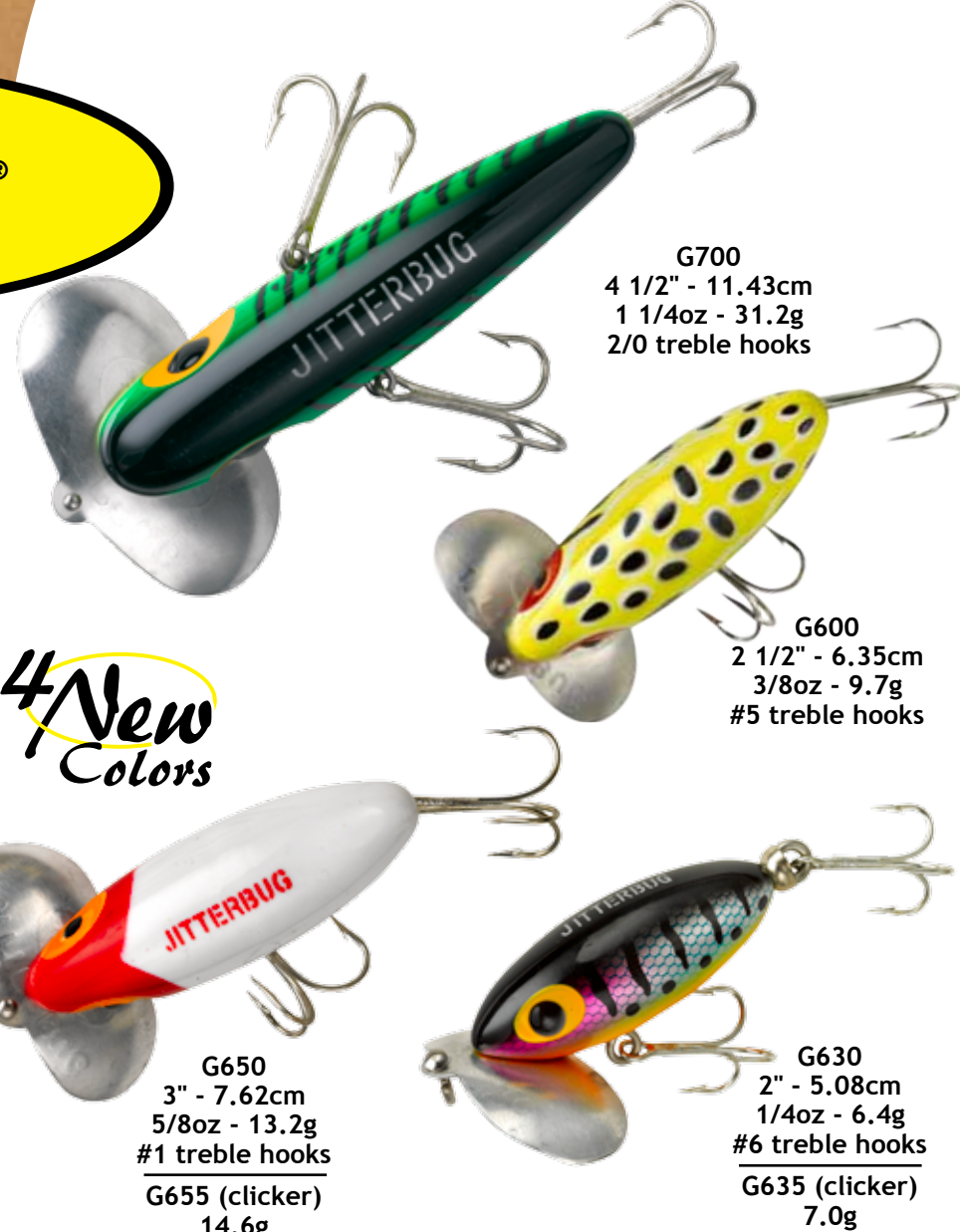
G700 4 1/2" - 11.43cm 1 1/4oz - 31.2g 2/0 treble hooks