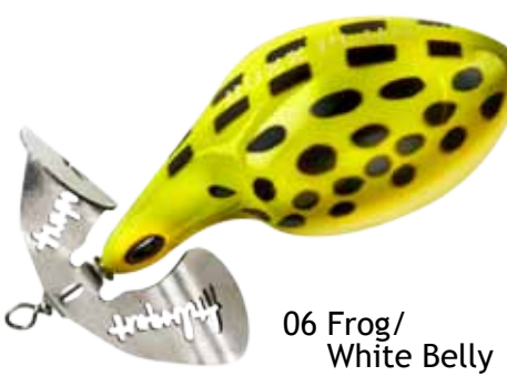
06 Frog/ White Belly