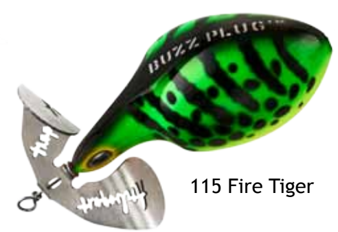
115 Fire Tiger