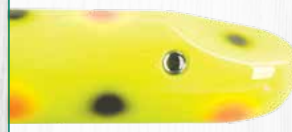
CS Chartreuse Spotted