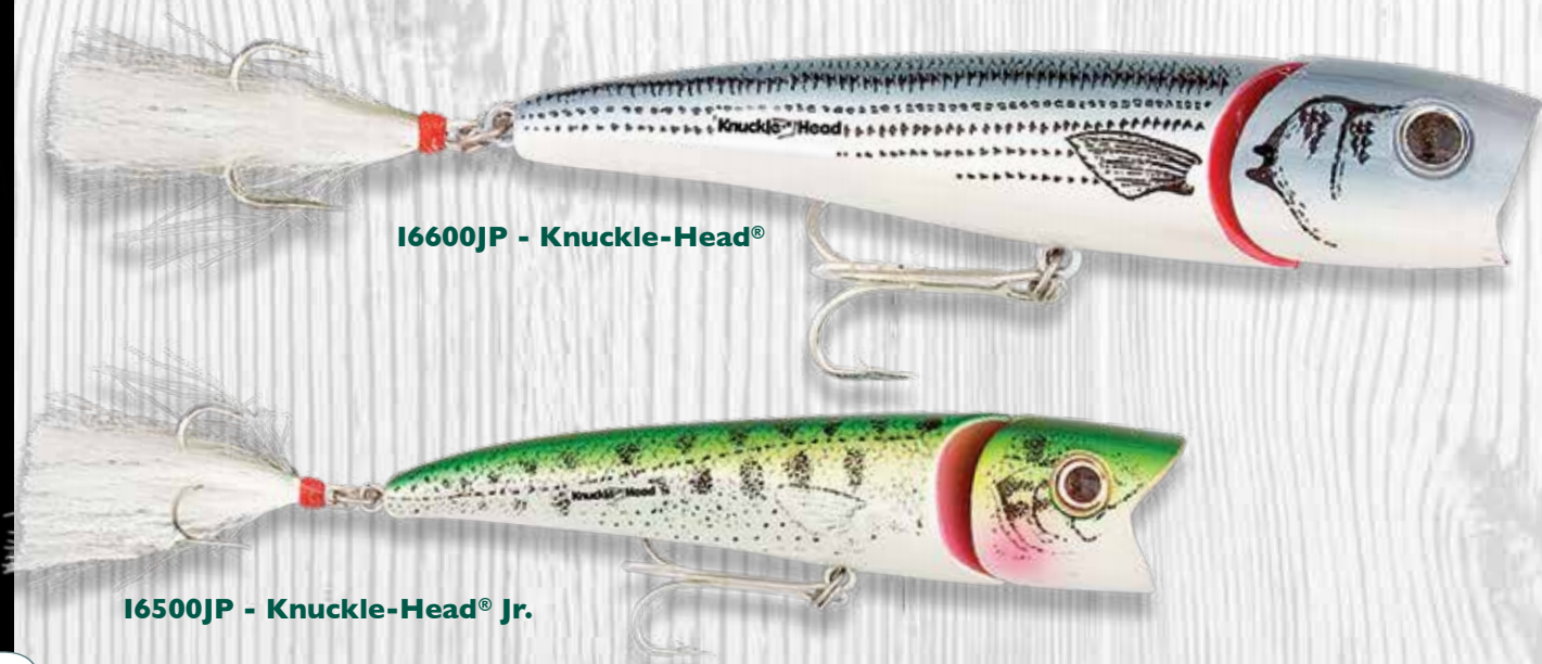
16600JP - Knuckle-Head®