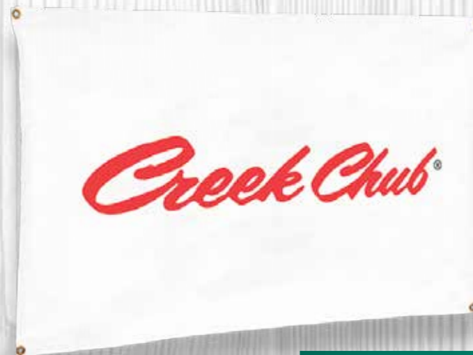
UW10385 - Creek Chub® Banner

A prominently displayed Creek Chub banner will alert consumers to the fact that you carry Creek Chub products. Made of weather-resistant Tyvek.® 4 1/2' x 2 1/2'. Grommets in all four corners.