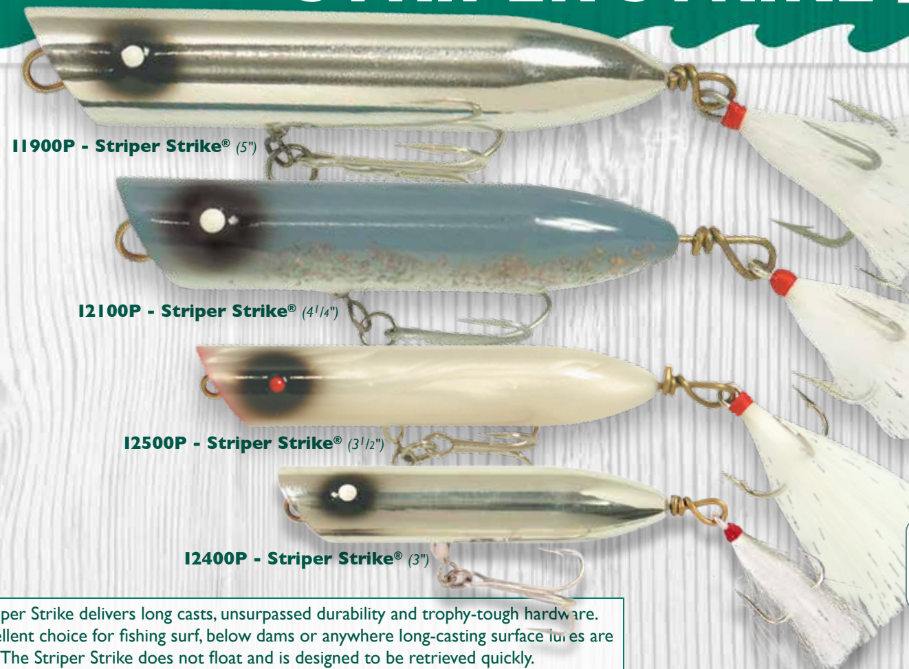
11900P - Striper Strike® (5")