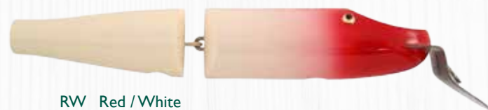
RW Red / White