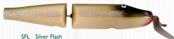
SFL Silver Flash