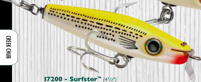
17200 - Surfster™ (4 1/2") (Heavy duty thru-wire construction)