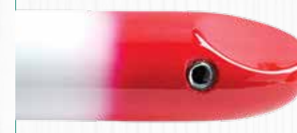
RW Red / White