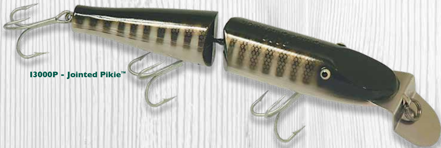
I3000P - Jointed Pike™

This steady, high-profile Jointed Pike attains depths of four to seven feet when casting and up to 11 feet when trolled. Its body is built from tough plastic polymer. The hardware of the Jointed Pike is selected for lasting strength and durability.