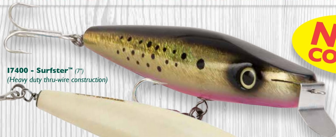
17400 - Surfster™ (7") (Heavy duty thru-wire construction)