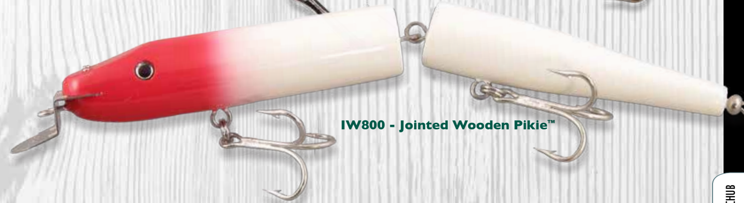
IW800 - Jointed Wooden Pike™

Anglers who are serious about catching heavyweight fish – whether muskies, strippers or other mammoth predator species – will not want to be without these versions of a classic Creek Chub lure. The Jointed Wooden Pike and Wooden Pike offer the classic Pike's distinctive fish-imitating profile, but are super-sized, traditional wood construction and equipped with ultra heavy-duty hardware and thru-wire construction. Both are designed to be cast L-O-N-G distances but are equally effective as trolling plugs.