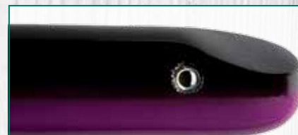
BLP Black Back / Purple