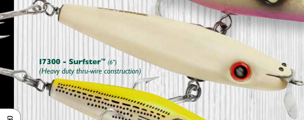
17300 - Surfster™ (6") (Heavy duty thru-wire construction)