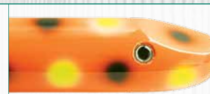
OS Orange Spotted