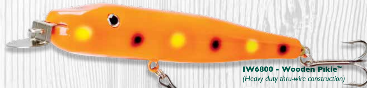
IW6800 - Wooden Pike™ (Heavy duty thru-wire construction)