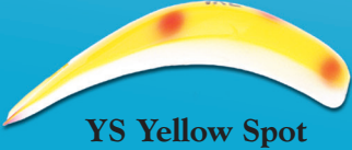
YS Yellow Spot