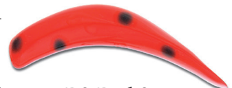
RS Red Spot