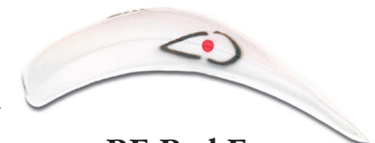
RE Red Eye