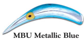
MBU Metallic Blue