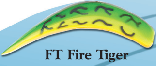
FT Fire Tiger