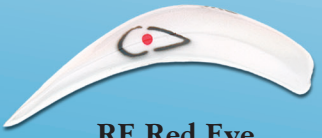
RE Red Eye