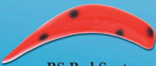
RS Red Spot