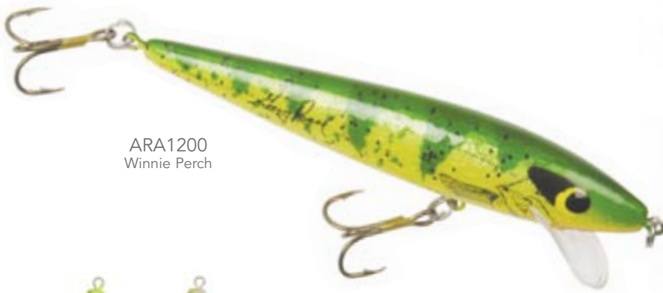
ARA1200 Winnie Perch