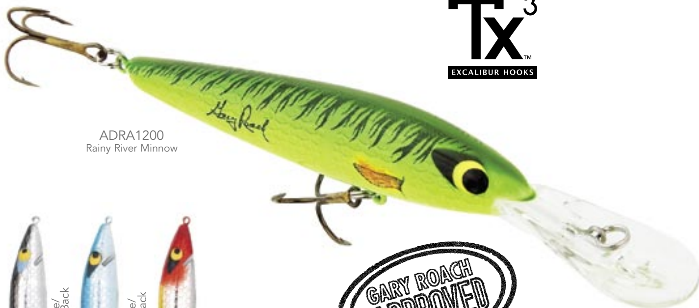
ADRA1200 Rainy River Minnow