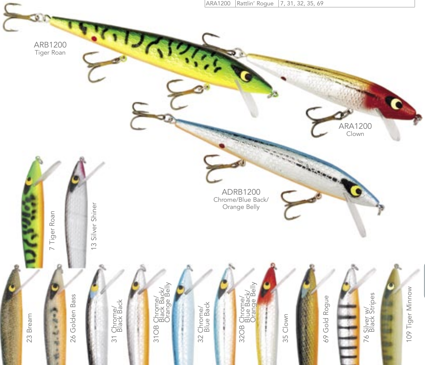
ARB1200 Tiger Roan