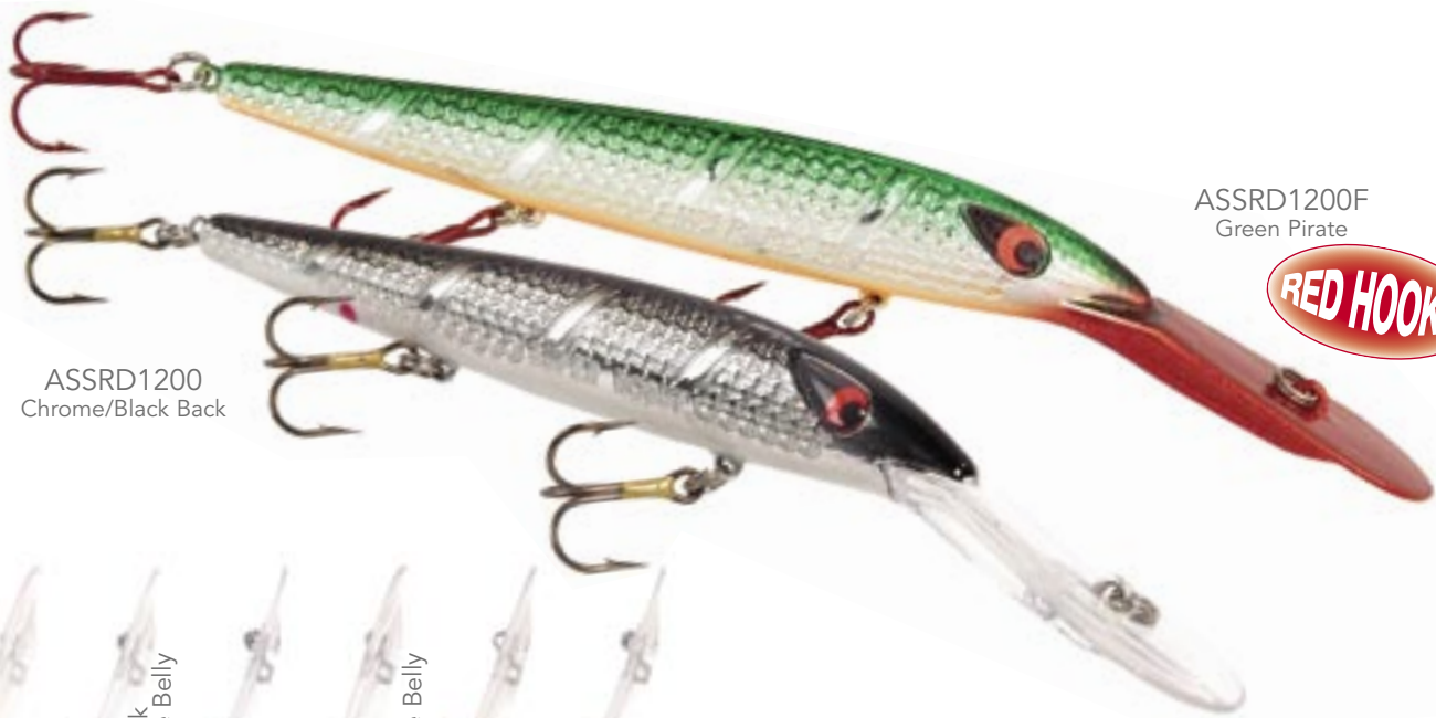
ASSRD1200F Green Pirate