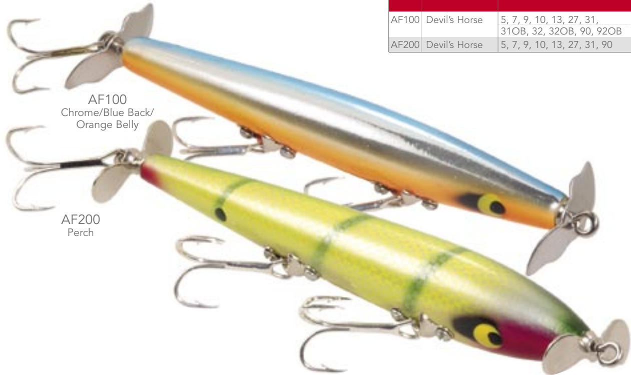
AF100 Chrome/Blue Back/ Orange Belly