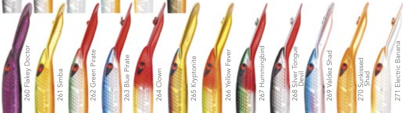
260 Flakey Doctor