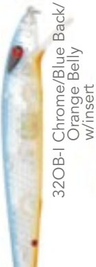
32OB-I Chrome/Blue Back/Orange Belly w/insert