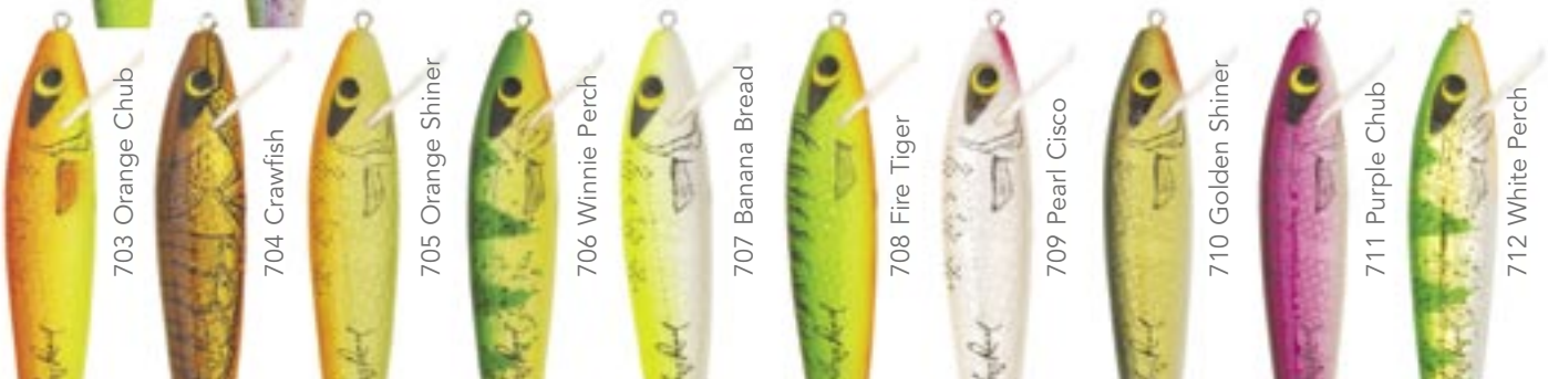
703 Orange Chub