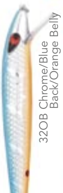
32OB Chrome/Blue Back/Orange Belly