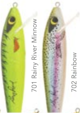
701 Rainy River Minnow