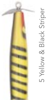
5 Yellow & Black Striper