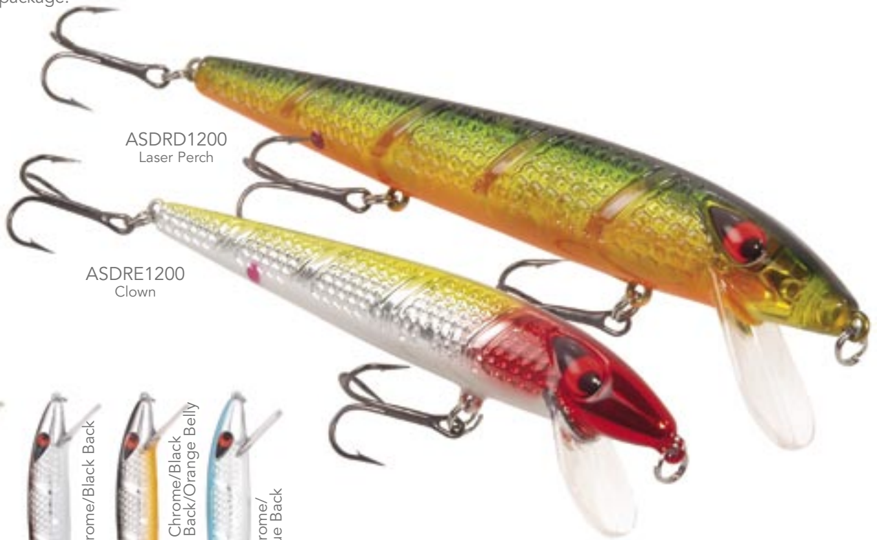
ASDRD1200 Laser Perch