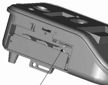
SD Card Slot

Once the internal memory has been erased, turn camera OFF , insert the SD Card in the slot as shown below and then turn the camera ON .