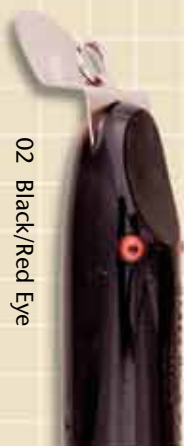
02 Black/Red Eye