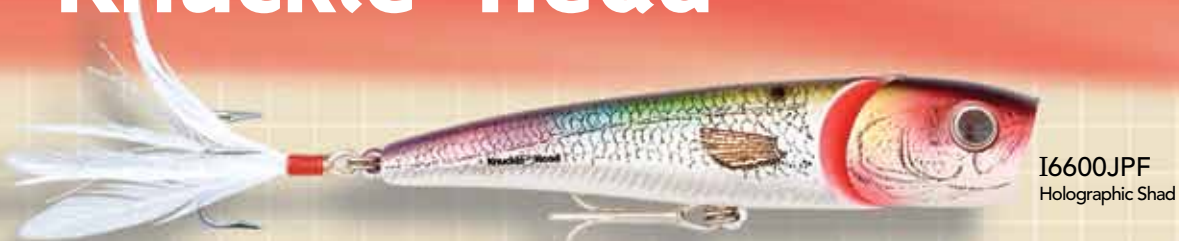
I6600JPF Holographic Shad