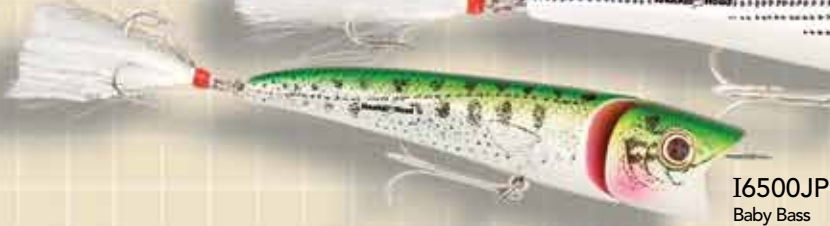
I6500JP Baby Bass

The Knuckle-Head and Knuckle-Head, Jr's. have captured the imagination of anglers from coast to coast. They're being used by surfcasters in the Northeast, muskie fishermen in the Midwest and bass anglers in the South. Who knew? Their unique jointed-head design has given them an unmatched action for all species of fish.