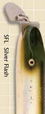
SFL Silver Flash