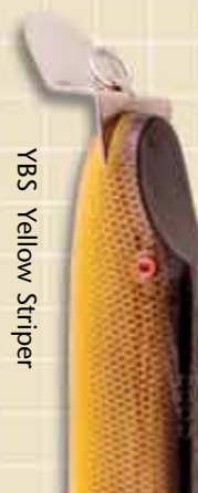
YBS Yellow Striper