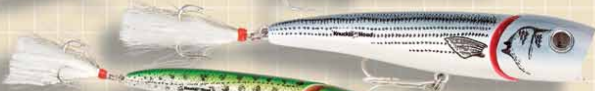
I6600JP Baby Striper